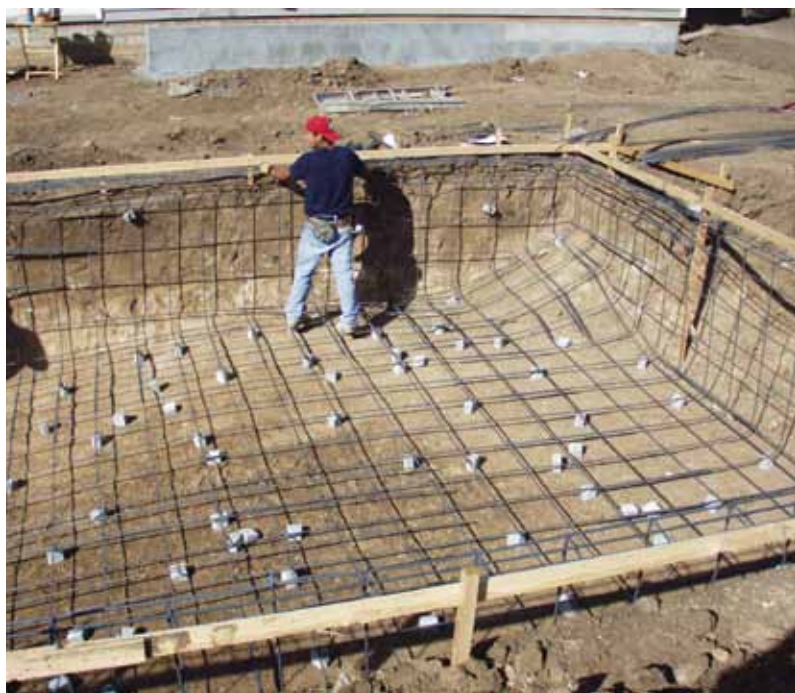
Standardized, proven designs for the typical backyard pool based on the experience of over 100,000 installations

What clients appreciate the most, however, is that Pool Engineering understands not only what contractors go through in the field but also how to help them develop practical solutions that are economical to build and strong enough for the tough building codes in the seismic areas of the western U.S., yet aesthetically pleasing enough to satisfy the pickiest Beverly Hills homeowner. This dedication to its customers is what makes Pool Engineering Inc. the remarkable success it is today.