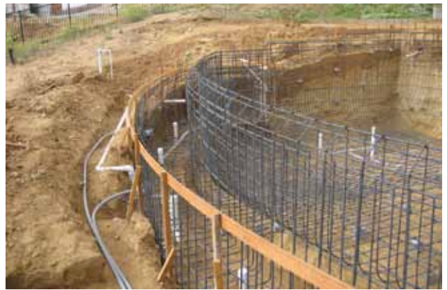
Experts in structural design and hydraulics for vanishing-edge pools