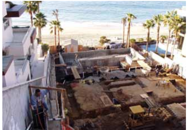
Structural designs for difficult locations