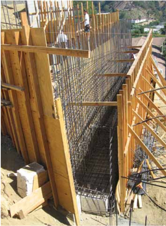
Complicated structural designs based on experience from installing over 100,000 pools